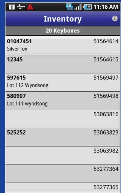
Manage Keybox inventory

U.S.A. 4001 Fairview Industrial Dr. SE Salem, OR USA 97302 T 800.547.0252 F 800.382.6119