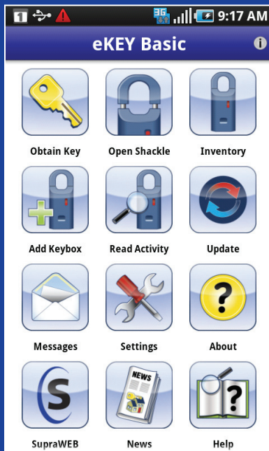
Access Keybox functions...

For more information visit us online at www.supraekey.com